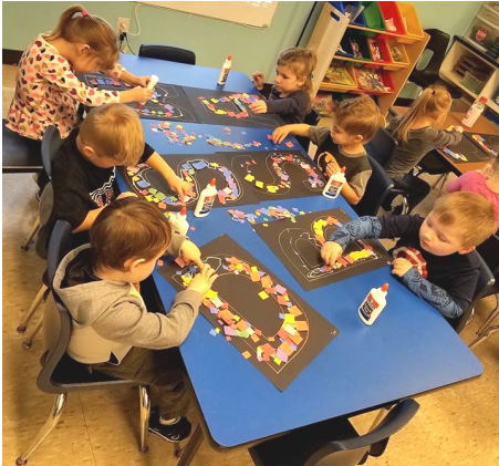
Learning the first letter of our names